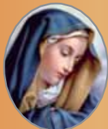
Our Patroness Mother of Compassion