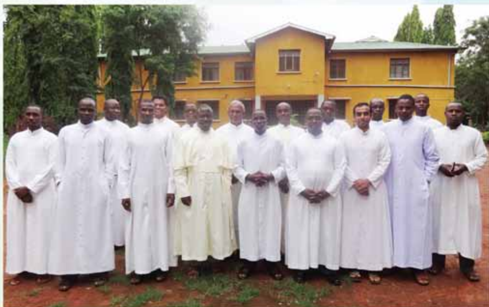
MSFS Scholastics in Theology Formation in Kola, Morogoro