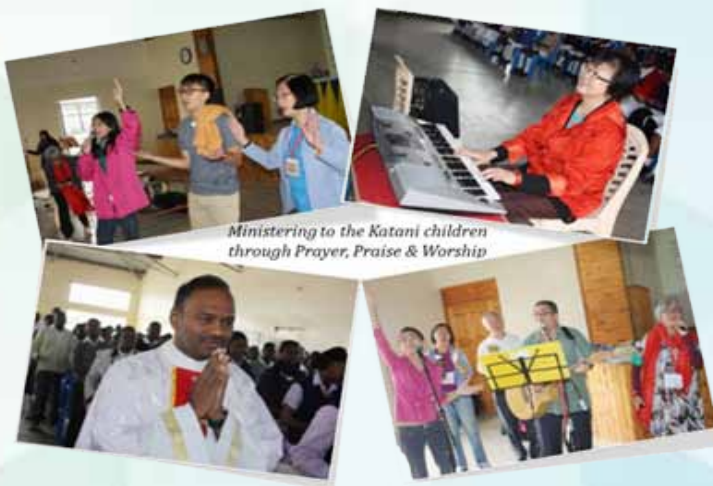
2014: Retreat @ SFS Integrated Primary School, Katani

The Fransalians visibly manifest God's love and presence in East Africa. They bloom where they are planted. Churches, schools, vocational and technical institutes, homes for special needs and other establishments have been 'planted' and they have bloomed and flourished! The missionary zeal is clearly present in each one of them, working tirelessly in God's vineyard, never failing to pray and to serve.