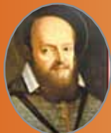
Our Patron St. Francis de Sales