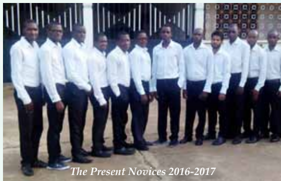
The Present Novices 2016-2017

Novitiate is the time of building ones call on right motivations and coming to be in conformity with God's will. It is the time of genuine test of oneself and also allowing oneself to be tested by others towards the aptitudes for becoming a lasting oblation for God and others. As a result one searches not outside his/ her but rather within and makes a firm yes to God as Mother Mary. One finds oneself as a treasure in the "earthen vessel". The one who in this life comes to that reality of knowing the worth and value before the Creator finds in fuller freedom to be at the service of Him generally and particularly in making selflessly his/ her life as a total