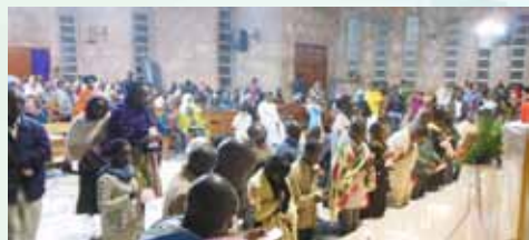
2014: Night Vigil @ St Joseph's Church, Mlolongo

Observing how they work and interact with one another, I can say 'How they love one another', not only among their fellow priests but also with people around them. It has made me feel that I am part of the big MSFS family.