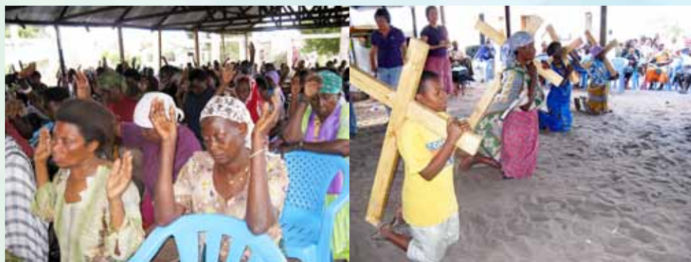
2008: A 3-day renewal retreat at Mji Mpiya

A Bible verse can best describe the community of the MSFS: "All of you have unity of spirit, sympathy, love for one another, a tender heart, and a humble mind." 1 Pet 3:8