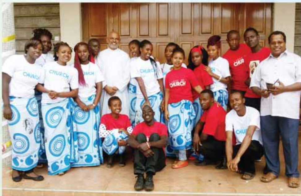
Catholic Youth Mlolongo, Nairobi