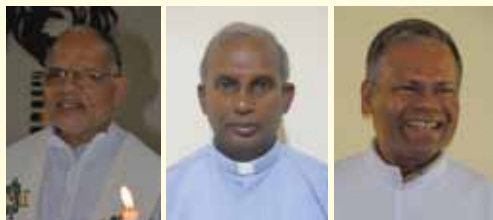
The three MSFS Pioneers in Africa