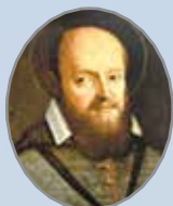
Our Patron St. Francis de Sales